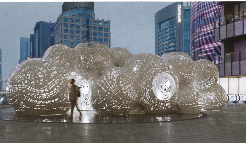
MARC FORNES/THEVERYMANY The public space winner, Boolean Operator, is a painted-aluminum pavilion in Suzhou, China.