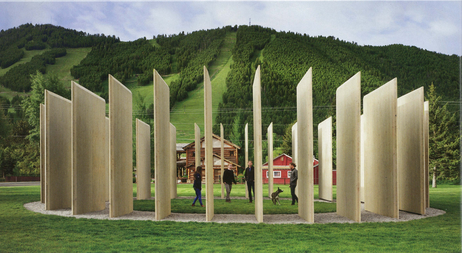
CLB ARCHITECTS Town Enclosure, 22 13-foot-high panels of spruce-pine-fir arranged as a temporary community hub in Jackson Hole, Wyoming, is a landscape honoree.