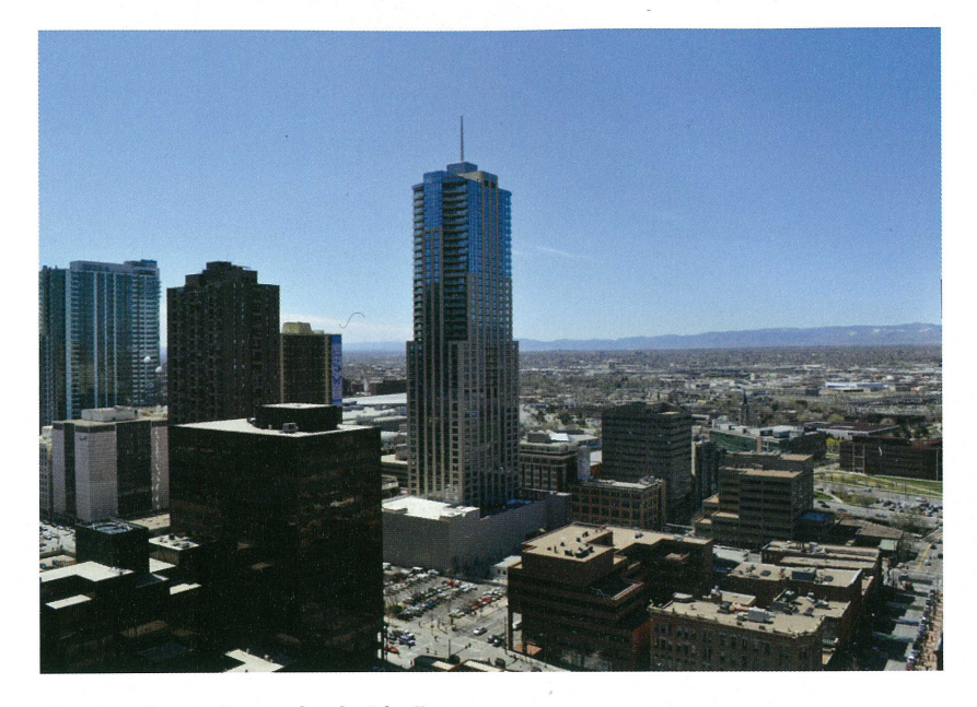
Above: Four Seasons, Denver, Below: Peaks View residence