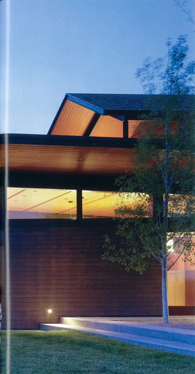
Left: An angled roofline above a glass pavilion gives a Wyoming home its modern edge in the back of the property, while more traditional forms face the street. Below: Japanese-inspired slats screen a floating staircase in the home's entry gallery.