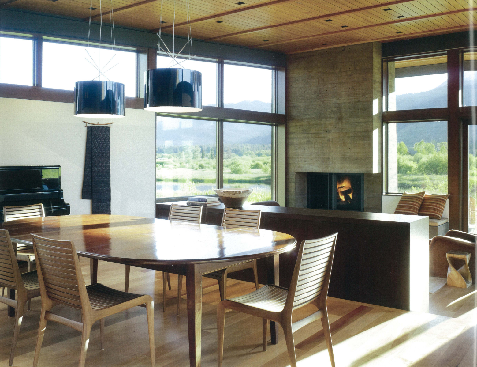
A cast-in-place concrete fireplace warms the living and dining areas.

mountains angles out between the two traditional forms of the house, and gives the home its modern pedigree in the privacy of the back yard.