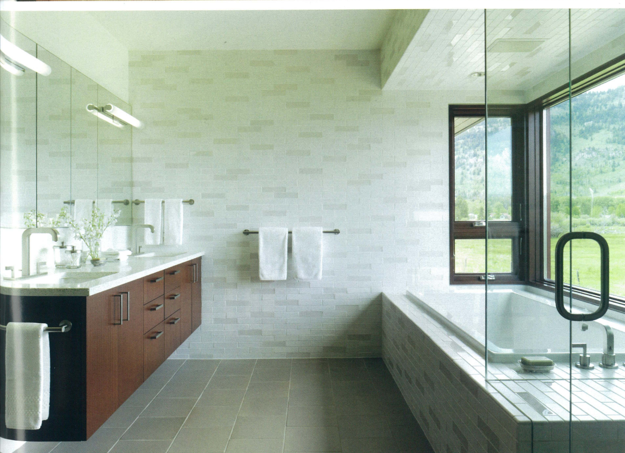
Above: An heirloom kimono greets visitors in the entry gallery. Left: Simple materials and pale colors combine to create an airy bathroom.