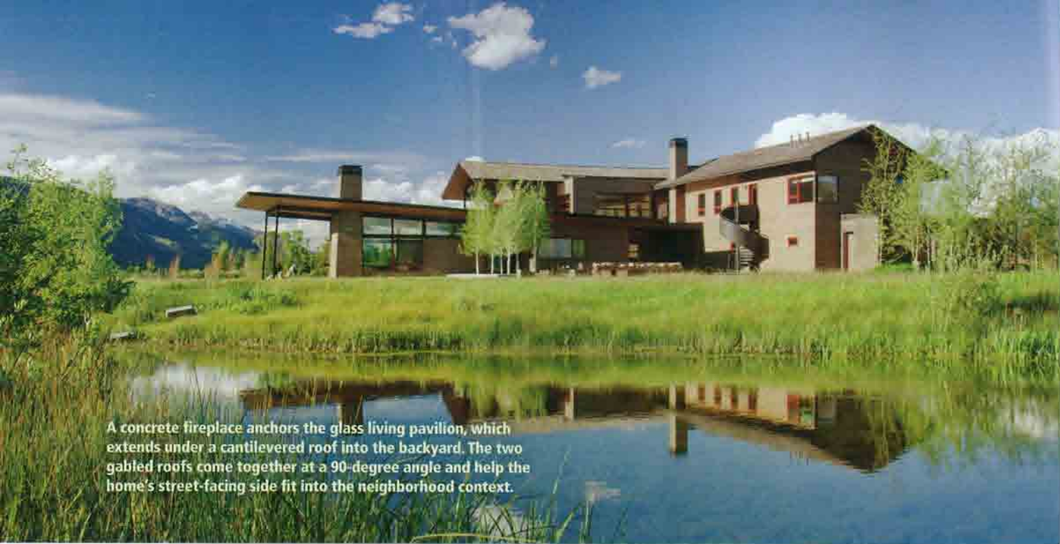
A concrete fireplace anchors the glass living pavilion, which extends under a cantilevered roof into the backyard. The two gabled roofs come together at a 90-degree angle and help the home's street-facing side fit into the neighborhood context.