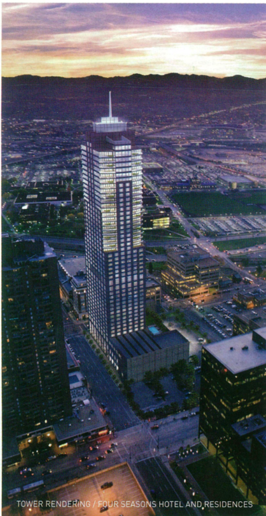
TOWER RENDERING / FOUR SEASONS HOTEL AND RESIDENCES