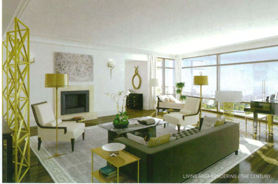
LIVING AREA RENDERING / THE CENTURY