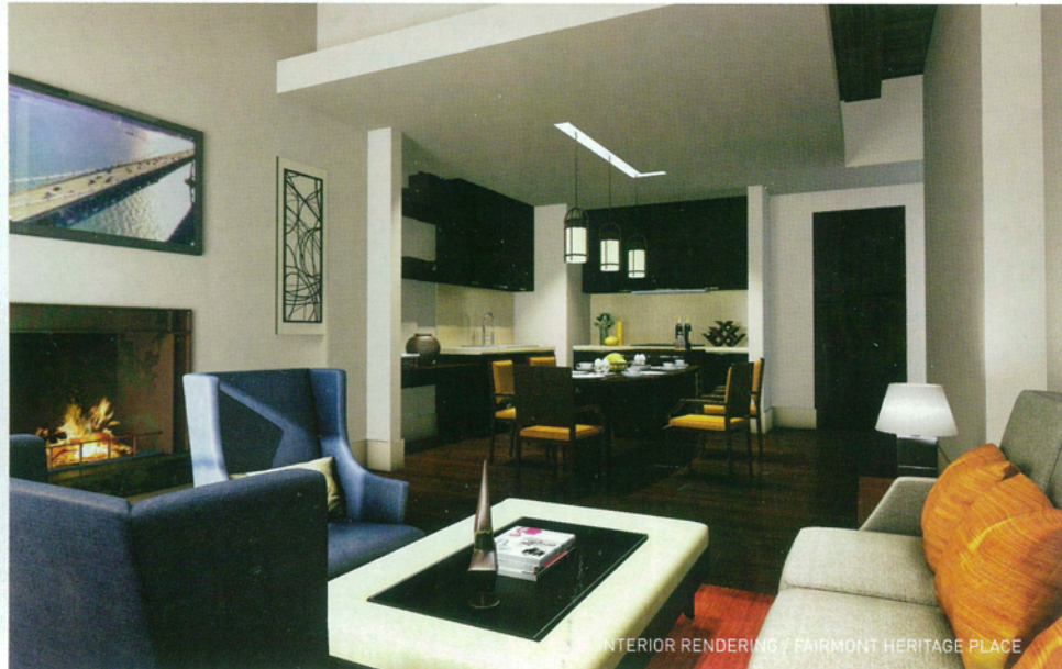
INTERIOR RENDERING / FAIRMONT HERITAGE PLACE