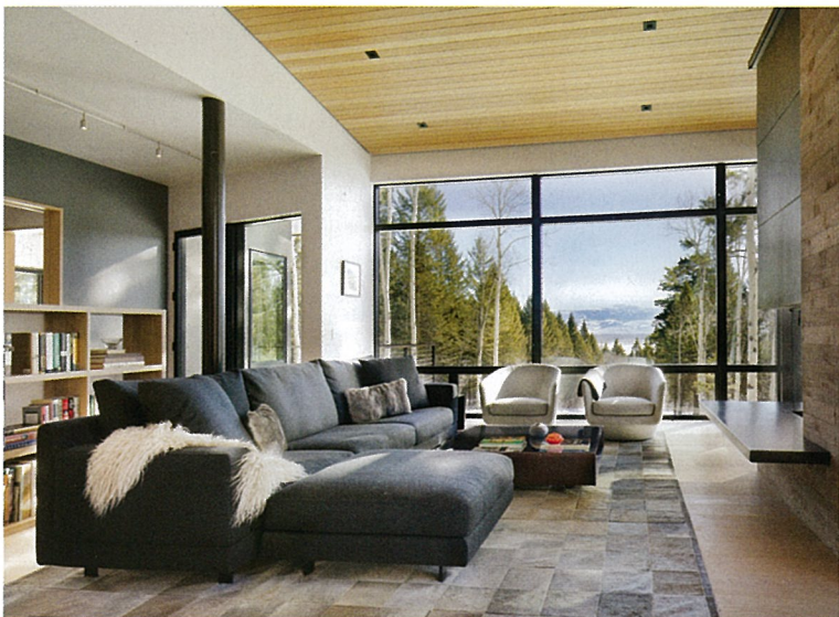
A sofa and armchairs from Bensen and a Kyle Bunting hide rug complement the warm interior environment of the Fish Creek Residence.