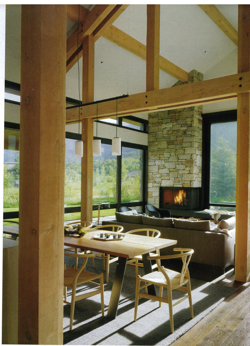
ABOVE: Expansive windows allow views of stunning scenery while providing a natural gathering place for the family. LEFT: Sleek, simple lines define the home's kitchen.

The house is 6,200 square feet, and includes an 800 square-foot garage and mechanical room. It sits on 1.5 acres with prime outdoor space, including a hot tub, fire pit, picnic table, garden, treed courtyard and plenty of lawn for the kids to play on. There's even a pond with fish.